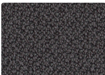
09PE Dark Grey