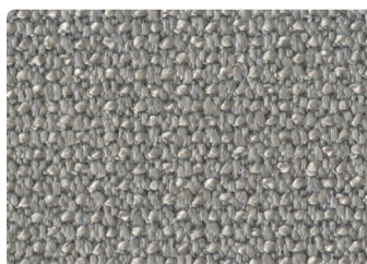
07PE Light Grey

Please use this sample card as indicative, only. It is provided as a guide. There may be variations between this sample card and the real samples.