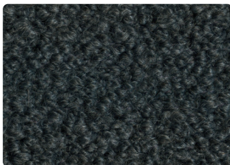
03CU Dark Grey